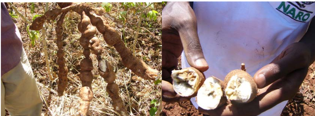
Figure 2. Root constrictions and corky necrosis arising from CBSD effect

The disease was mainly observed on improved CMD resistant cultivars throughout the country and on only one landrace (Kabwa) being grown in Mukono (Table 5). The most affected cultivars were TME 204 and TME 14 with CBSD incidences ranging from 58.5-100% and 3.3-91.5%, respectively. Tuberos root deformation and root necrosis (Fig. 2) were observed only in Kaberamaido district and 100% of the harvested tuberos roots were affected. The damage levels (scale 1-5) were very high with average severity score of upto 4.6 (Table 5). A colossal loss of this magnitude warrants careful choice of cassava varieties to promote if cassava production in the country is to be upheld and famine averted especially in communities where cassava is a major source of food.