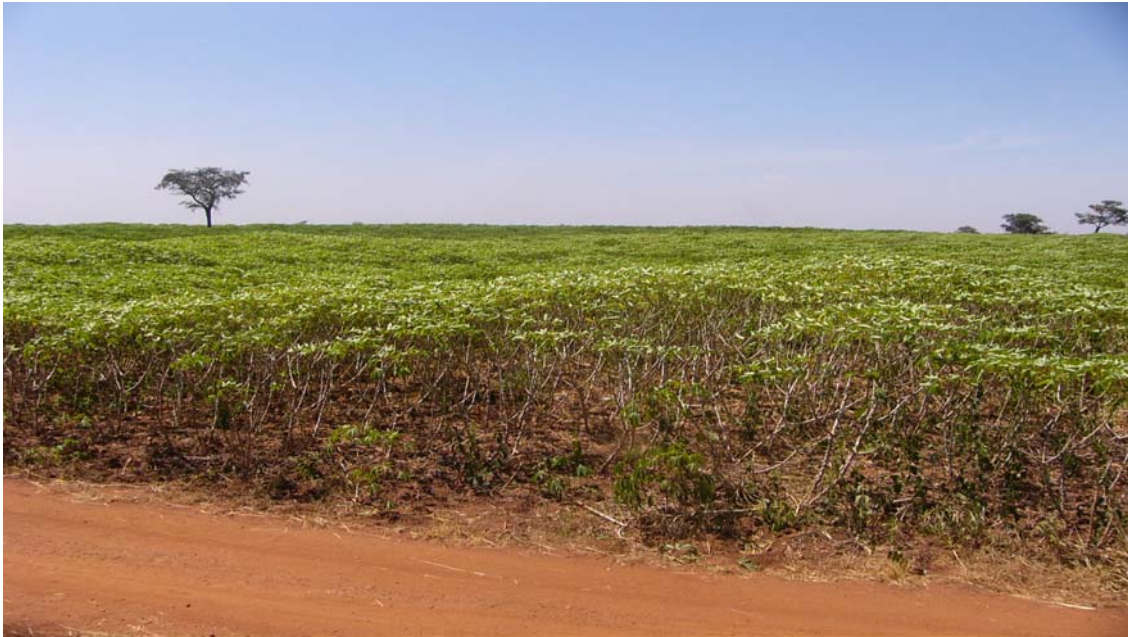
Fig. 3. Institutional multiplication of TME 204 at Loro Prison Farm in Apac District, Uganda.

depend mostly on cassava for their livelihood. There is therefore more gloom than ever before given that the country has just recovered from an epidemic of CMD through wide promotion and distribution of CMD-resistant varieties to the farmers. Unfortunately the very popular varieties are being devastated by CBSD!.