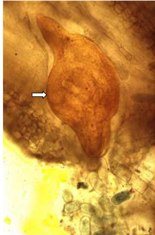
Female root-knot nematode (arrow) in root. A number of laid eggs can be seen.

In coffee, the galls produced tend to be rather small and spherical in shape and are often restricted to the vicinity of the root tip. This is in contrast to galls on vegetables, for example, where the galls occur along the length of the root, often coalescing to form large, irregular, growths.