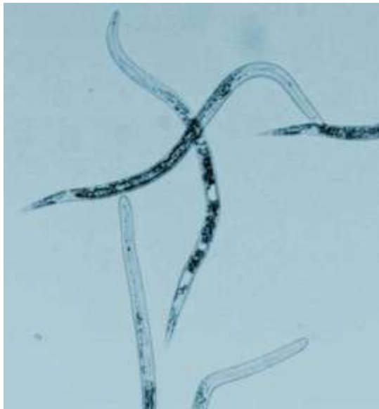
Root-knot nematode infective juveniles.

the root parenchyma cells in the immediate vicinity of the nematode, thereby forming the swelling or gall that is so characteristic of these nematodes. The females are found within galls on the roots. The shape of the gall can be helpful in identifying the species present, although in coffee most root-knot galls have a similar appearance, being almost spherical and found near or at the root tips. The galls are actually swellings of the root tissue and serve to enclose and protect the